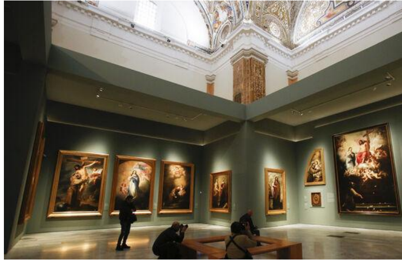
Museo de Bellas Artes